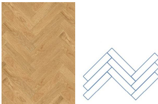
Figura 1,2 Illustrative Photo. The picture shows only the characteristics of grade