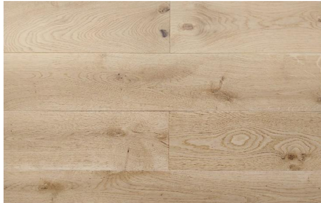
Figura 1, Illustrative Photo. The picture shows only the characteristics of grade