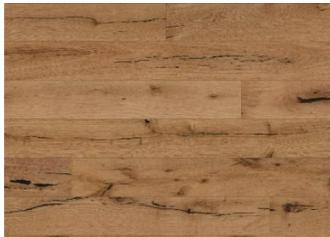
Figura 1,2 Illustrative Photo. The picture shows only the characteristics of grade