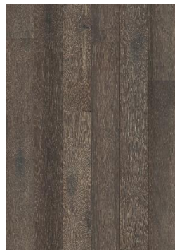
Figura 1,2 Illustrative Photo. The picture shows only the characteristics of grade