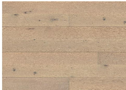
Figura 1,2 Illustrative Photo. The picture shows only the characteristics of grade