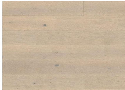
Figura 1,2 Illustrative Photo. The picture shows only the characteristics of grade