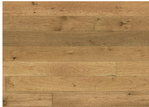
Figura 1,2 Illustrative Photo. The picture shows only the characteristics of grade